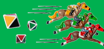
Photo Finish Racing Quick Rules Summary